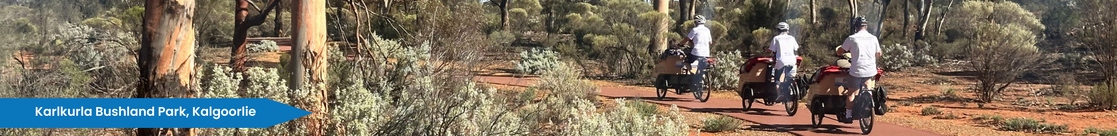
Karlkurla Bushland Park, Kalgoorlie

“I live across the road from the park, but have been hesitant to walk here. I now have the confidence to venture out and walk the paths myself.”